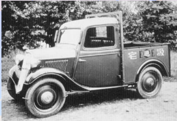
The Datsun 14T (April 1935)

Nissan, as one of the world’s few automakers to offer a comprehensive product line of passenger and commercial vehicles in markets worldwide, has its own long history of work vehicles going back to the company’s founding and its first production vehicle, the 1935 Datsun 14T minitruck.