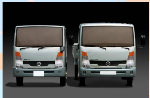
Design-stage comparison of Atlas F24 (left) and Cabstar (right)

Cultural and regional requirements are a necessary consideration in designing commercial vehicles for today's global marketplace. Nissan produces the Atlas series in Japan, Europe, China and Mexico, so needed to organize the design requirements for each market's unique use and size regulations