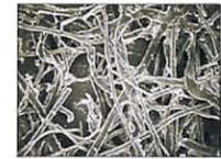
Non-Genuine (coarse mesh)