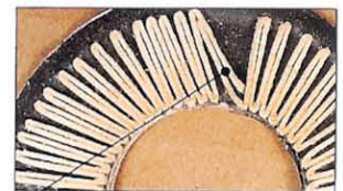
Lack of End-to-end Filter Paper Joint

Genuine Nissan Oil Filters have been designed just for your Nissan.