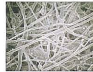
Genuine (fine mesh)